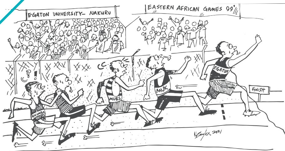
Extracted from 2nd EAUG 2001 publication

● The championships include Sports for PWD; Woodball; Cricket; Hockey; and Cross Country among others also scheduled to start in 2023.